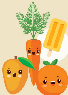
MANGO, ORANGE JUICE, CARROT JUICE