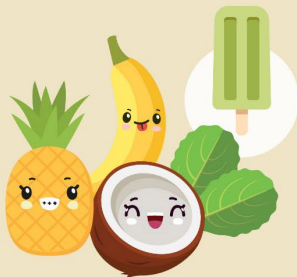
PINEAPPLE, BANANA, COCONUT MILK, SPINACH